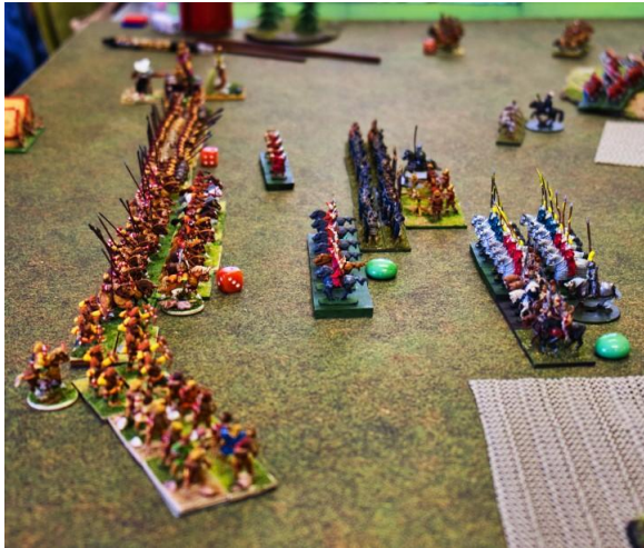
Sassanid Archers Force March to the Flank

The Sassanids force marched their bowmen to the outer flank of their cataphract command and then used both horse archers and bowmen to shoot in an attack on the heavy cavalry command on the Roman left. Both sides took losses but the Roman cavalry, assailed by cataphracts to their front and archers to their flank, was overwhelmed. Meanwhile, on the other flank, the Sassanid armored horse archers flanked and then fired volleys into the Roman auxilia , goading them to leave their fortifications and go over to the attack. This went badly for the auxilia . In the center the Sassanid spearmen managed to avoid contact with the legionaries long enough for the decision to be reached elsewhere. The Romans broke on the flanks before their center engaged.