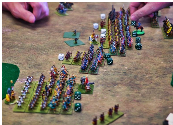
Behind the Patrician Left