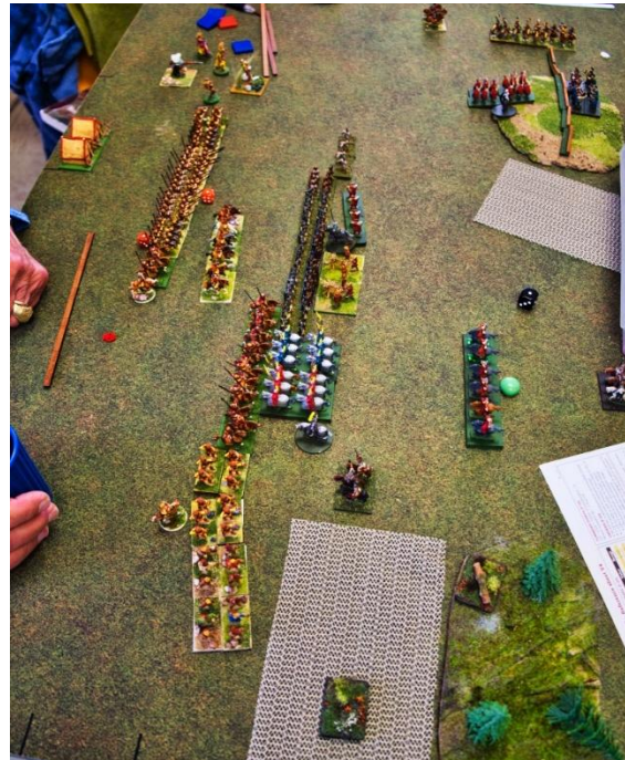
The Battle from Above

Dave Newport's Gepids fielded two mounted commands, one with four cavalry units and the other with twelve, and an infantry command with four impetuous heavy swordsmen, four medium bowmen, and two light infantry. Les Stuart's Late Imperial Romans fielded one heavy cavalry command that included two cataphracts, a command of six legionaries with three light infantry, and a command with four Gothic impetuous heavy swordsmen, two auxilia medium swordsmen, and two medium archers. The battlefield was largely open, with a plowed field adjacent to the Roman camp.