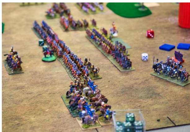
Behind the Patrician Right

The Patricians advanced quickly, taking advantage of the broader frontage their somewhat cheaper infantry without artillery or missile support allowed them. Meanwhile the Patrician light cavalry command successfully came in on the Late Imperial Roman left flank and rolled along it. Terrain had little effect on the fighting, and the Late Romans soon found each of their commands coping with overlaps. After fierce fighting and losses on both sides, the Late Imperial Romans broke and the Patricians secured a victory.