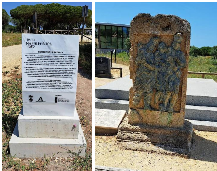
Battle of Barrosa Memorial Park