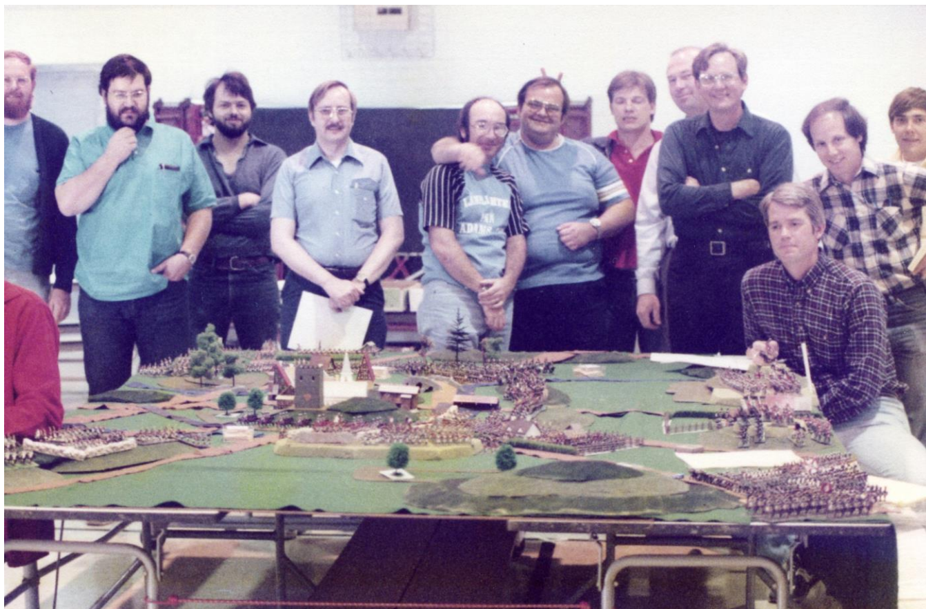
Members posing for a photo c.1982