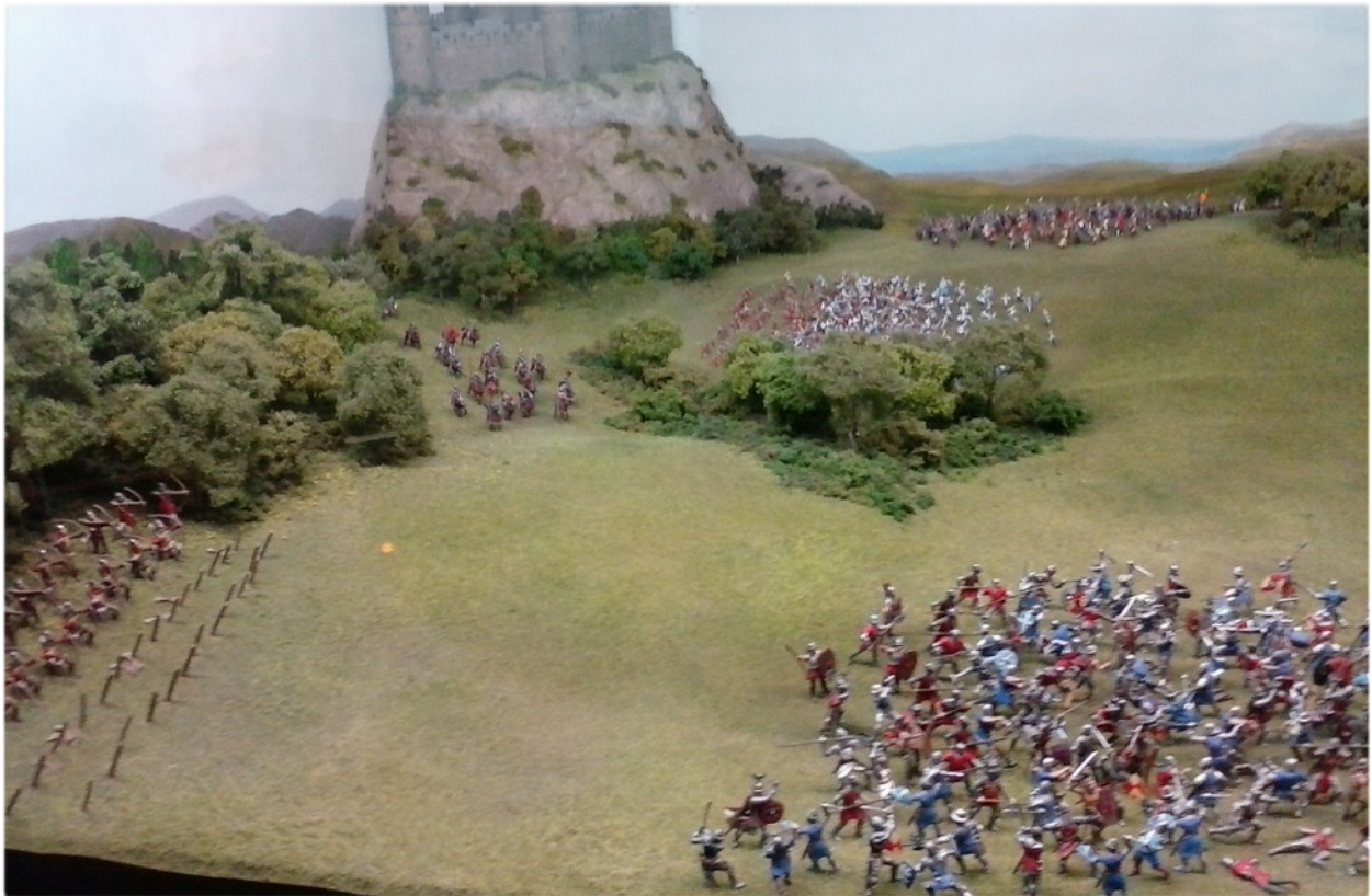
Miniature World Victoria B.C. Canada