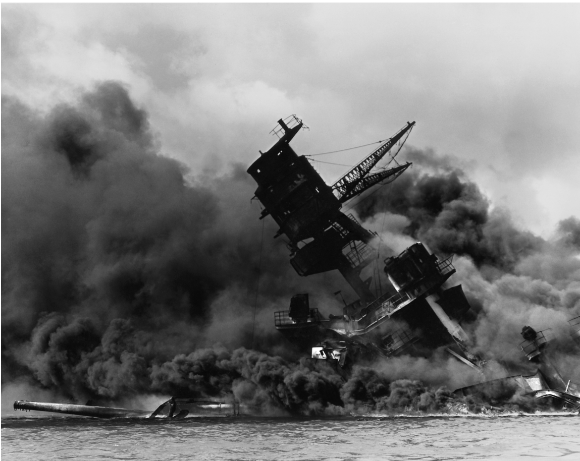
USS Arizona burning on December 7 th , 1941 at Pearl Harbor

-Pearl Harbor Speech (1941) by F.D. Roosevelt