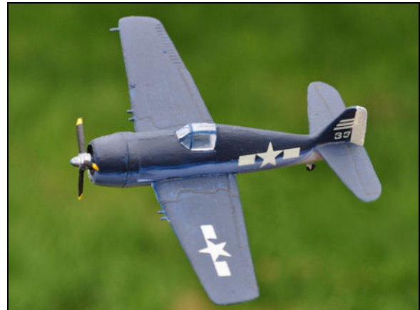
Revell (Germany) – Plastic Kit

A contract between the US Navy and Grumman aircraft in 1941 was signed for a follow up design to the F4F Wildcat. Although superficially shaped the same, the Hellcat was a totally new aircraft incorporating the powerful P&W R2800 engine, requiring a high strength airframe and components.