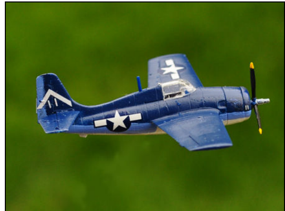
Sweet Aviation Models – Plastic Kit

Designed in 1936, as a follow on to the F3F bi-plane, the original XF4F-1 design was also a bi-plane. However, the competing F2A Buffalo from Brewster was a low wing monoplane and Grumman realized that a bi-plane would not be competitive. Grumman withdrew its initial design and resubmitted a monoplane design designated the XF4F-2.