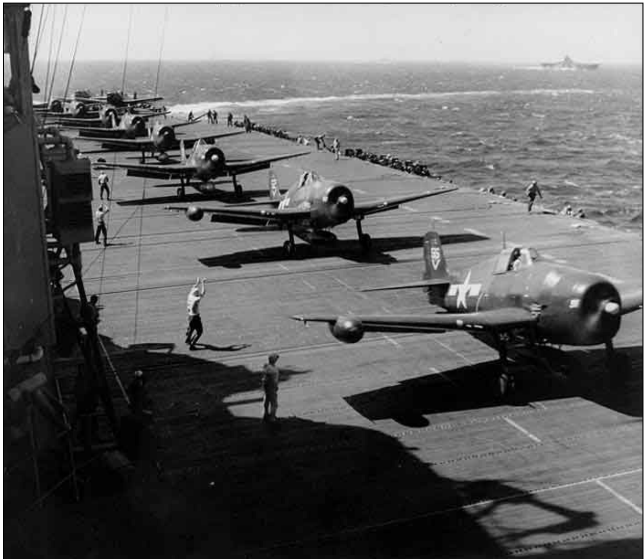
F6Fs prepare to take off from USS Ticonderoga during World War II