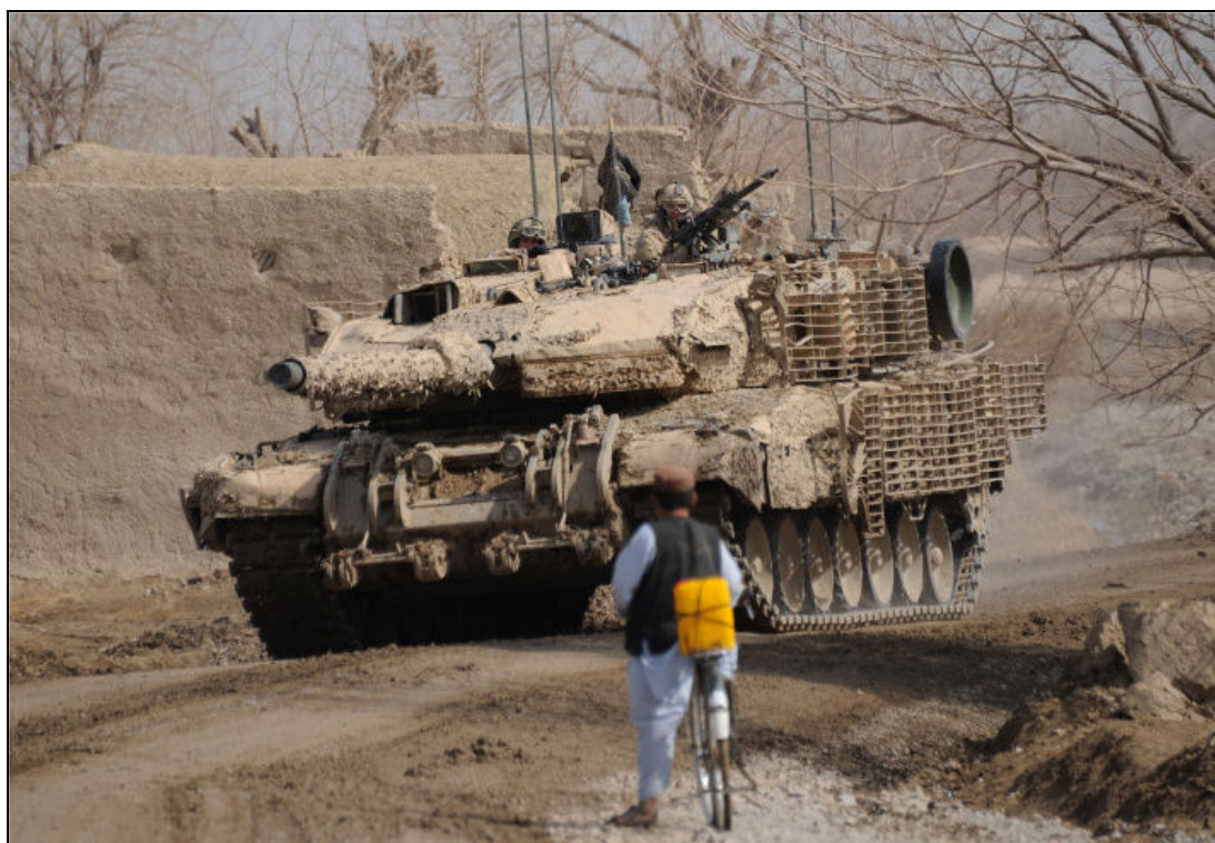
Canadian Leopard 2A6M tank rolling down a road in Afghanistan.