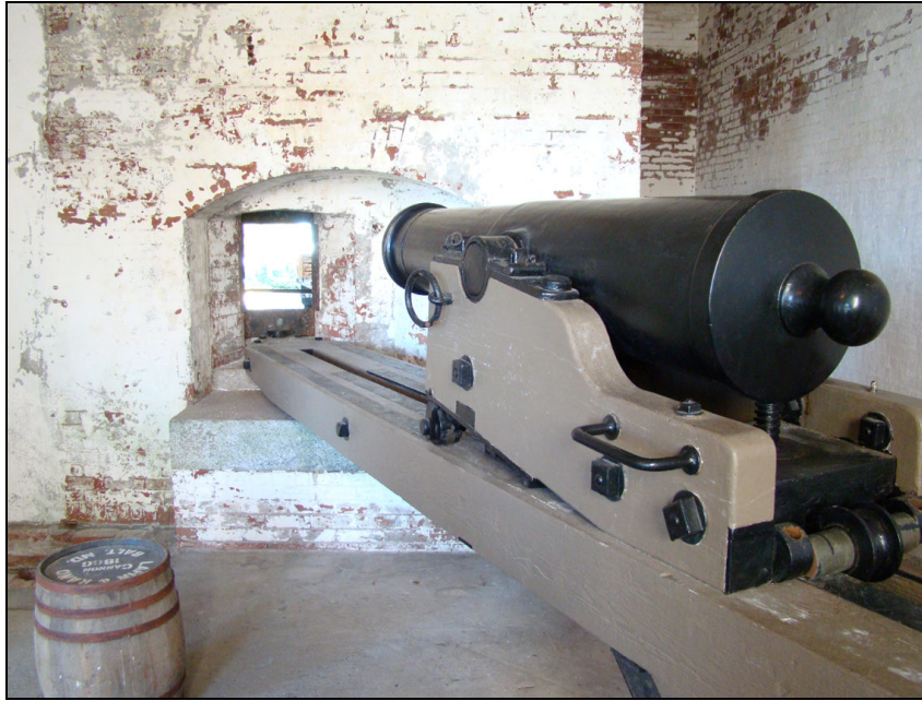
Part of the defenses of the Gate House on Alcatraz.