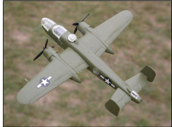
Minicraft – Plastic model kit

Armament: Up to 18 x 0.50 Browning M2, 1 x 75mm cannon, Up to 6,000 lbs of bombs, rockets or torpedoes.