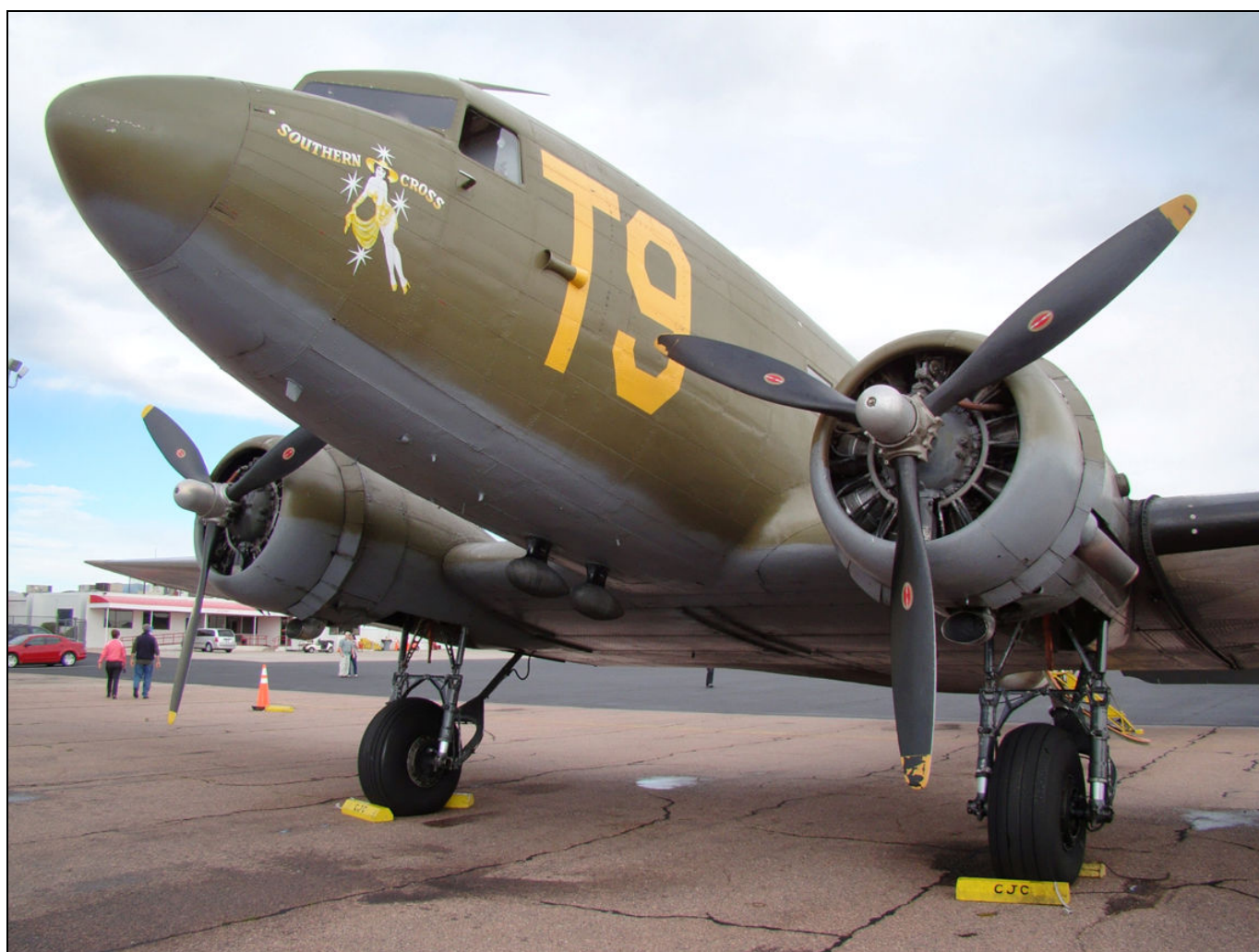
C-47 Flight in Colorado Springs