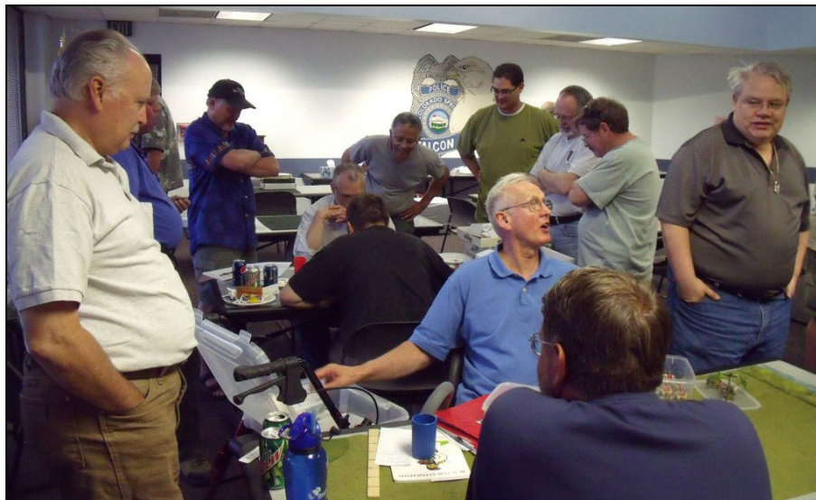
Table 1 Game of the Month ( WINNER )