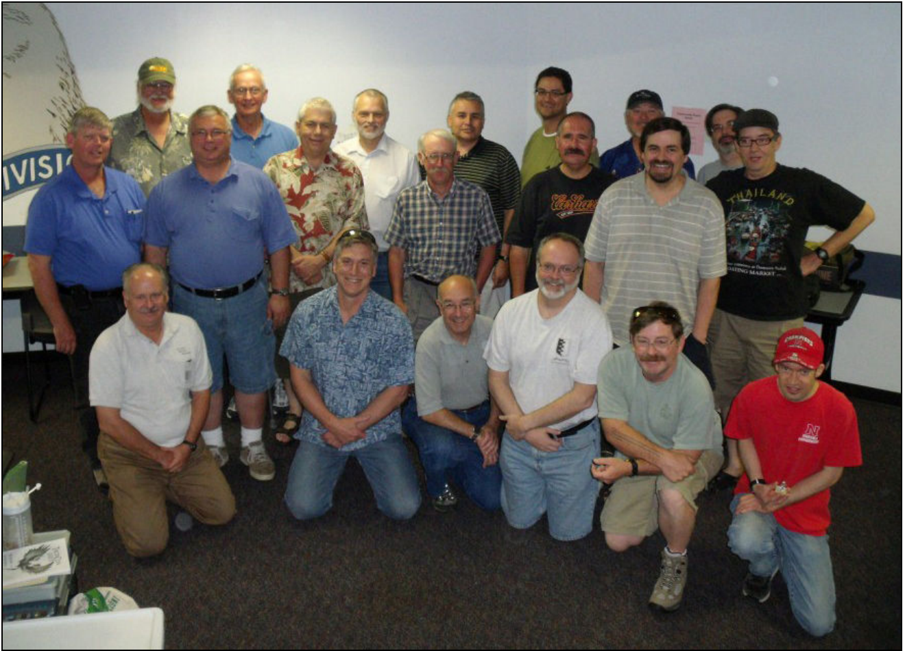
Group shot of CMH and CSGA members that competed in the first DBx smackdown.