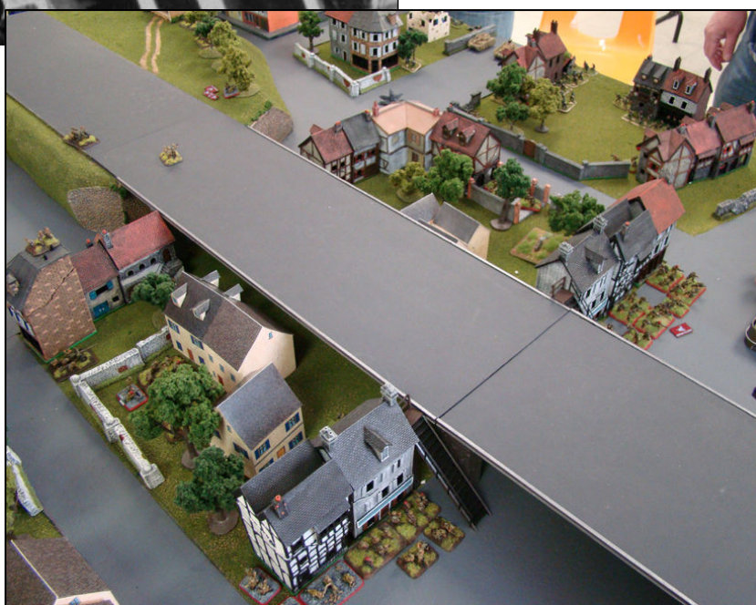
Arnhem Bridge CMH Meeting January 2011