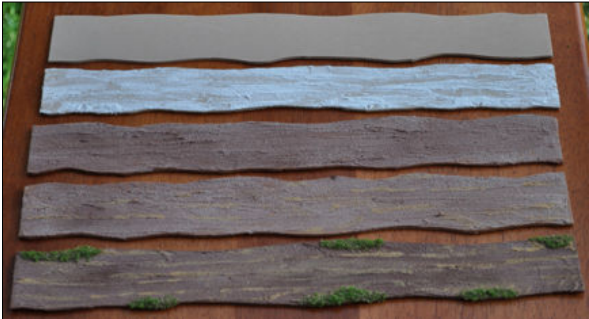
Examples of roads at various stages